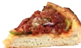
Deep Dish Chicago style | Sauce on top